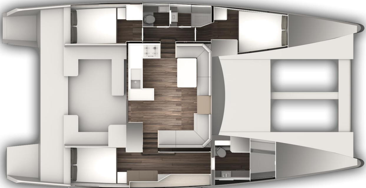
Interior layout – LASTA Design Studio