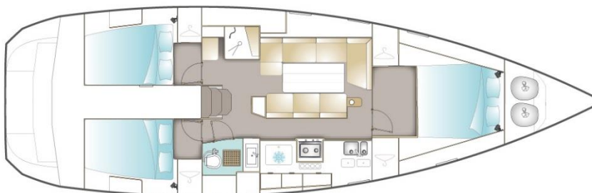
VERSION / FAMILLE AVEC CABINE PROPRIÉTAIRE AVANT (OPTION)