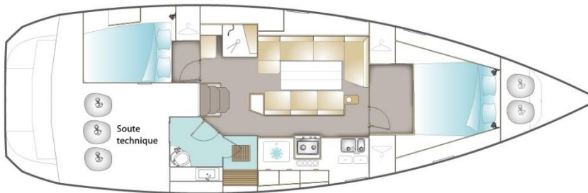
VERSION / DEUX CABINES DONT CABINE PROPRIÉTAIRE AVANT