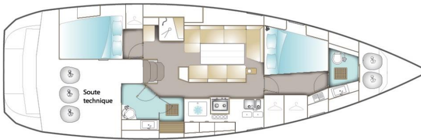
VERSION / DEUX CABINES