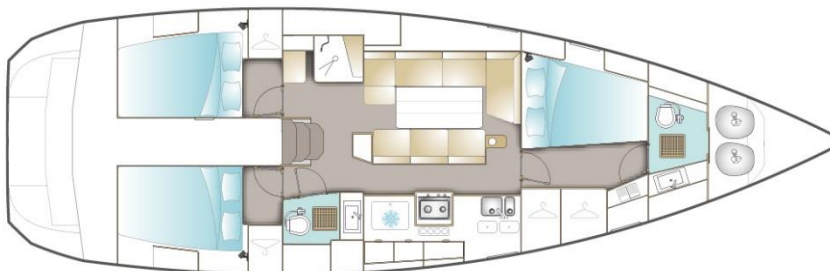
VERSION / FAMILLE / TROIS CABINES (OPTION)