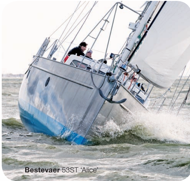
Bestevaer 53ST 'Alice'