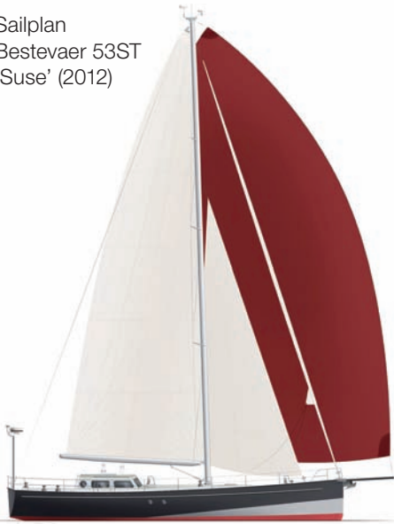
Sailplan Bestevaer 53ST 'Suse' (2012)

Hydraulic lift keel Ice reinforcement in the bow Water ballast system Swimming platform Carbon mast and boom Painted hull Esthec or teak on deck Tiller steering Type of interior styling Central heating system Air-conditioning/Floor heating 1 or 2 wet cells