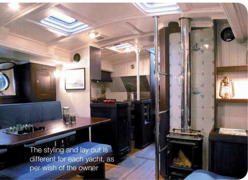
The styling and lay out is different for each yacht, as per wish of the owner