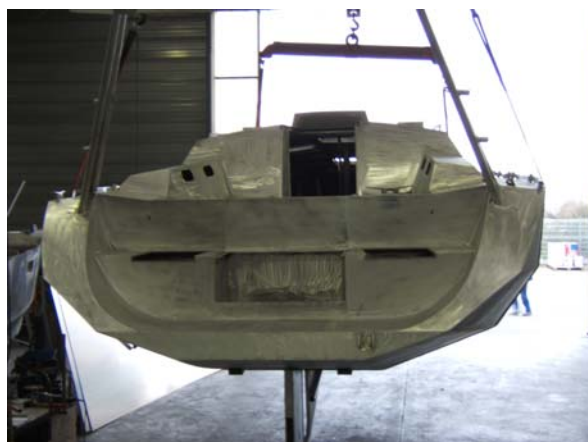
An Ovni 365 at the end of welding

The first of the new 365's hit the water in Les Sables d'Olonne earlier this month. This has been an eagerly awaited event and there is a backlog of people waiting to test this model which promises to more than uphold the good name of the Ovni's. For those quick off the mark, there are a few build slots left for next summer (June/July) so now is the time to make that trip to Les Sables to confirm your order. Just give us a call and we'll arrange a test sail for you. The Southampton 365 is due to be launched at the end of June, giving her new owners time for a leisurely sail back before the show. Make sure you come and see the latest baby. We are also planning to have a 435 to view near to the show.