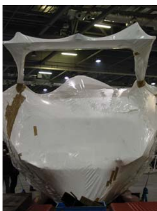
The standard Ovni radar arch gives 'Jemima' her distinctive outline - even double shrink wrapped.