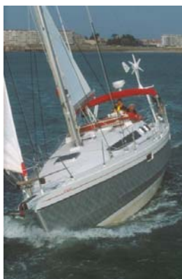
Ovni 345 undersail

When we think of aluminium sometimes it's that sheet of stuff we use to wrap the turkey at Christmas that first comes to mind. But the aluminium alloy that Alubat use to build the Ovni's isn't in the same category and we will have samples of the Ovni hull plating at the boat show for you to touch, feel and appreciate the immense strength of this material.